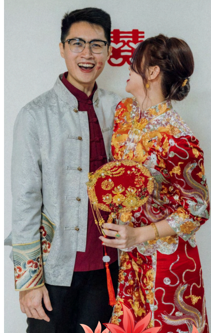
STANDARD SERIES QUN KUA TANG JACKET