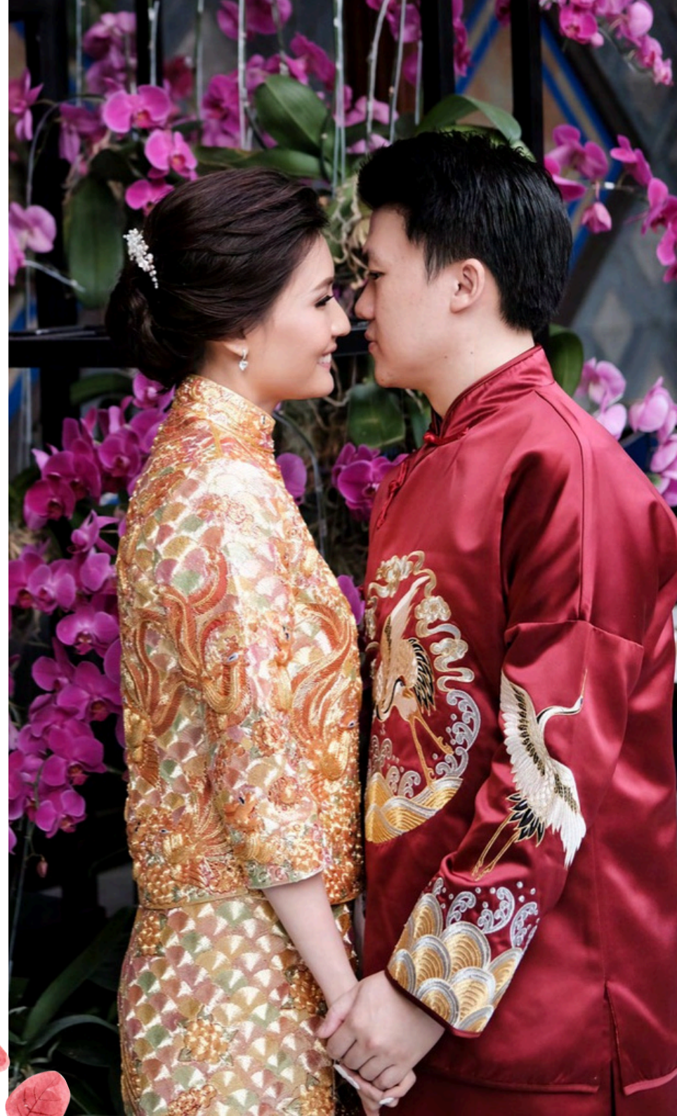
KING SERIES QUN KUA STANDARD SERIES MAKUA